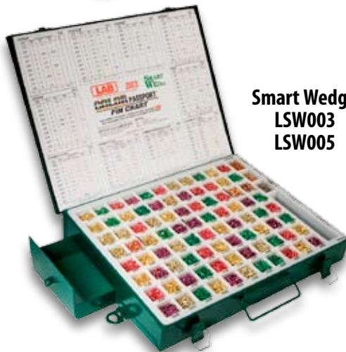
Smart Wedge LSW003 LSW005