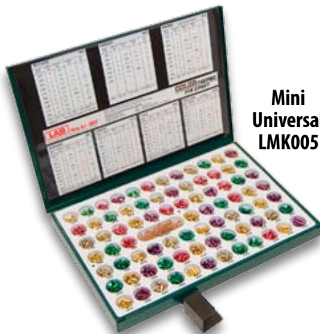
Mini Universal LMK005