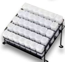
Vial Stadium LSS001